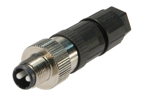
Pic. 1 M12 connector with POF contacts and GI-fiber contacts