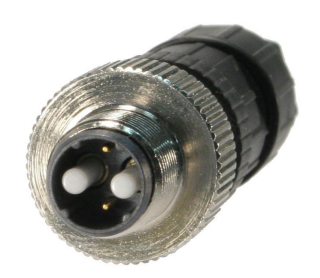
Pic. 2 M12 connector with 50/125µm and electrical contacts